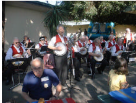
Peninsula Banjo Band entertains at Free Summer Family Picnic - June 2001