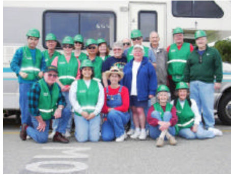
Emergency Disaster Drill Team April 2001

Call Our Hotline at (408) 491-9229 to leave a message.